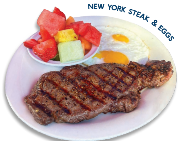
NEW YORK STEAK & EGGS