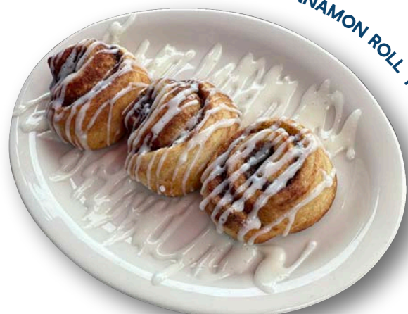
MINI CINNAMON ROLL TRIO

A side salad served with a cup of savory soup