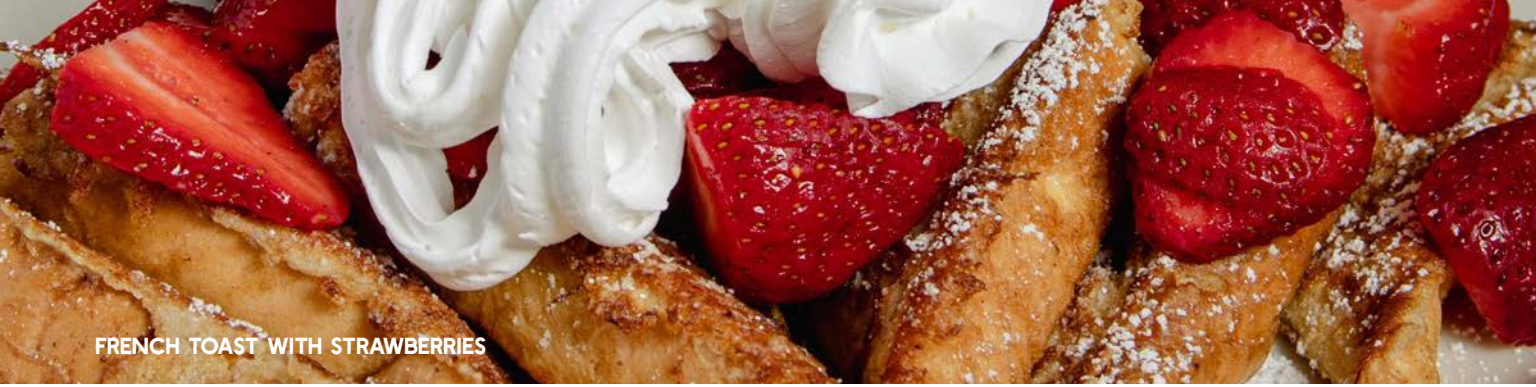
FRENCH TOAST WITH STRAWBERRIES