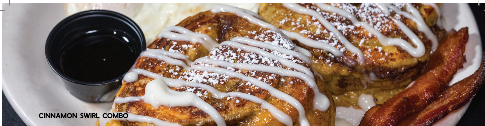
CINNAMON SWIRL COMBO