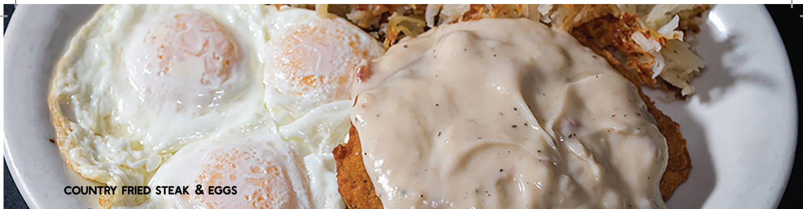
COUNTRY FRIED STEAK & EGGS