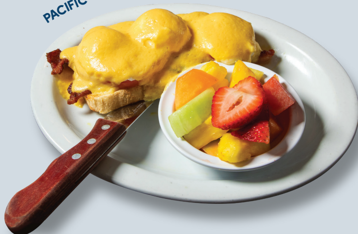
PACIFIC COAST HIGHWAY BENNY

a toasted piece of thick sourdough topped with poached eggs, two crispy strips of bacon, grilled tomatoes, avocado, smothered with creamy hollandaise sauce